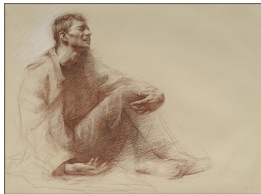
Study for the name