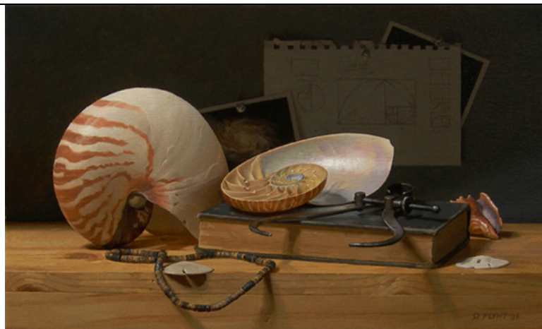
Understanding Phi 2008